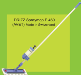
DRIZZ Spraymop F 460 (AVET) Made in Switzerland